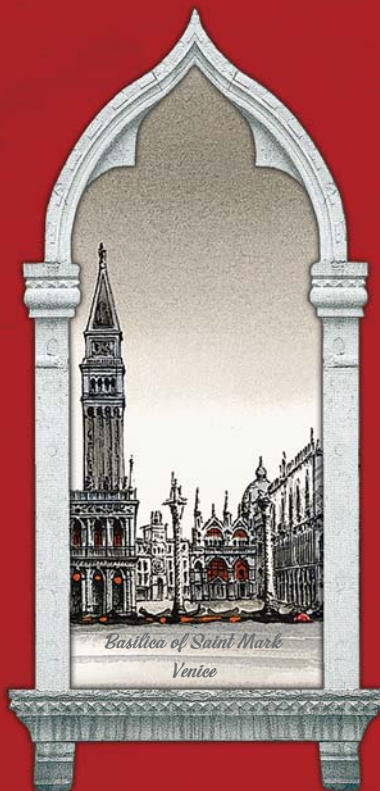
Basilica of Saint Mark Venice