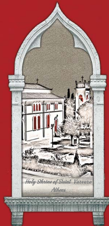
Holy Shrine of Saint Varvara Athens