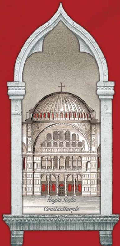
Hagia Sofia Constantinople